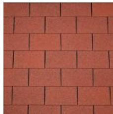
10 – Tile Red