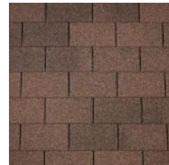
07 – Dual Brown