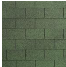
03 – Amazon Green