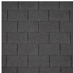
01 – Black