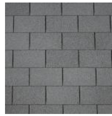
31 – Slate