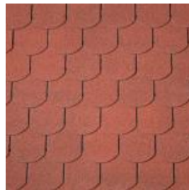
10 – Tile Red