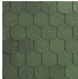
03 – Amazon Green