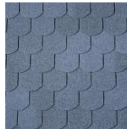
16 – Sky Blue