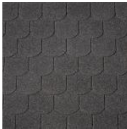
01 – Black