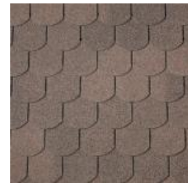
07 – Dual Brown